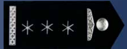
Chief warrant officer